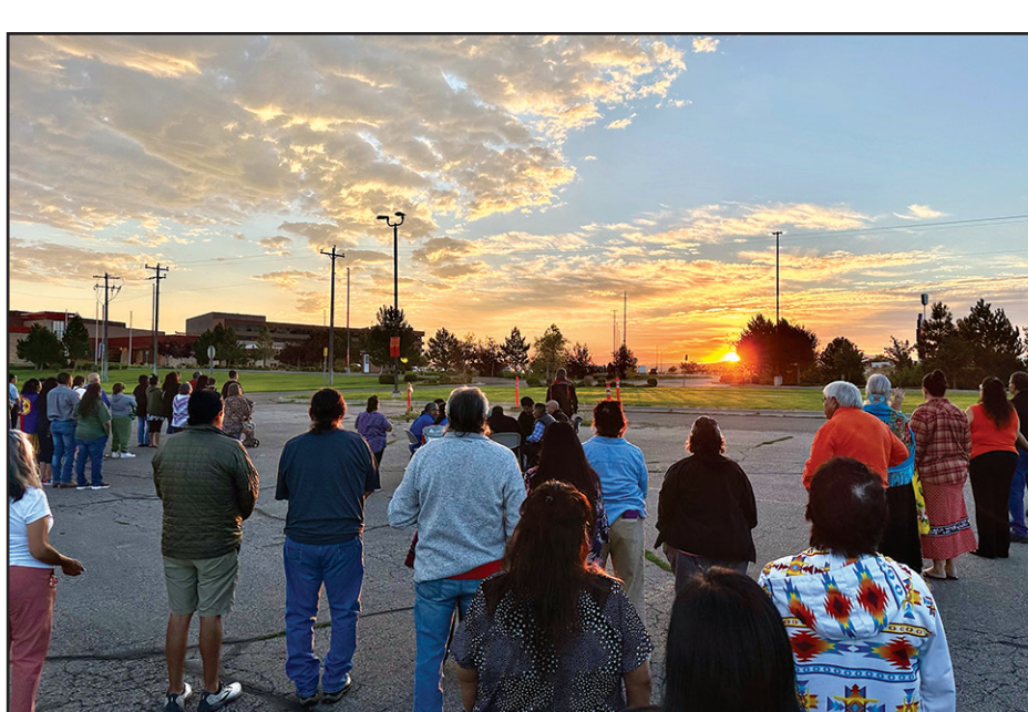
Shoshonean Reunion sunrise ceremony on August 6.